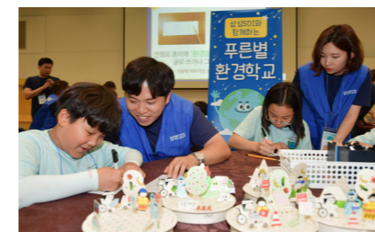
Green Planet Environment School – summer camp

Green Planet Dreaming School consists of general education offered in four sessions with a focus on science study classes under the free semester system as well as career concerts through which Samsung SDI employees working in related industrial sectors share their knowledge and experience.