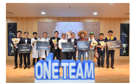
CA activity - Culture Fair

Our department-level organizational management indicators aim to improve the soundness of the organization, and support our organizational culture change management tools. While these indicators include most basic ones that are essential for organizational management, additions or revisions are also made each year in line with major issues. There are 10 indicators in five categories and two domains in total that address such topics as communication & collaboration and work-life balance. In 2019, an integrated organizational management system was launched to increase its operational efficiency. This system visually presents information in tri-colored light format to show the weaknesses of respective organizations, and also enables employees to perform self-assessments.