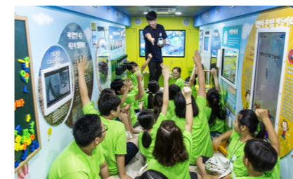
Green Planet Environment School – learning on the bus

Following the pilot phase operation in 2018, this educational program was provided to 3,354 students in 2019 to benefit a total of 3,751 students on a cumulative basis.