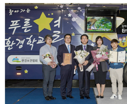
First Prize Awarded at the Educational Donation Awards 2019

'Green Planet Environment School' specifically has in mind those elementary schools that are located in remote island and mountainous areas in the vicinity of our worksites and thus could not provide a sufficient hands-on learning environment due to their financial and geographical limitations. To help address inequalities in educational opportunities, this program is operated in two different formats: summer camps open during the summer vacation period while itinerant Green Planet Environment School buses directly visit beneficiary schools during the semester. Garnering huge interest among children and support from parents, this program was attended by 10,626 students in 2019 to reach 36,836 in total cumulative number of beneficiaries since its launching.