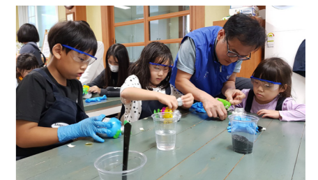
Green Planet Future Science School – general education

In addition to general education provided at local children centers, Green Planet Future Science School also hosts annual science camps: children who have participated in this program before are invited to the Company to attend the science concert led by professionals, join experimentation classes with our employees, and experience our business infrastructure. In 2019, this benefited 4,298 children at 27 local children centers in the vicinity of our six worksites. To help narrow the educational divide, we will continue to provide science learning opportunities for children from low-income families and serve as a corporate leader in making educational donations in so doing.