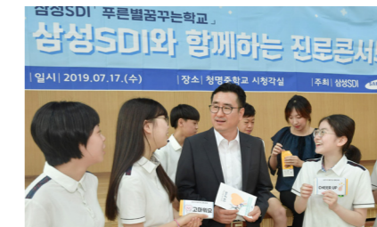
Green Planet Dreaming School – career concert