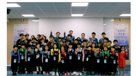
Green Planet Future Science School – science camp