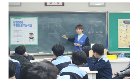
Green Planet Dreaming School – general education

Our plan for 2020 is to extend the scope of beneficiaries to include middle schools in the vicinity of our six worksites (Yongin, Suwon, Cheonan, Cheongju, Gumi, and Ulsan). The duration of this program will also extend from four to eight sessions to allow for more in-depth sharing of our employees' professional capabilities and the evolution of this program into a more advanced one that enables students to generate their creative outcomes. By offering students an opportunity to search a range of career options and have hands-on experiences, we will contribute to nurturing future talent.