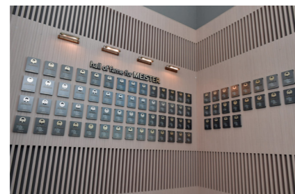
Hall of Fame for Technical Meisters at the Gumi worksite