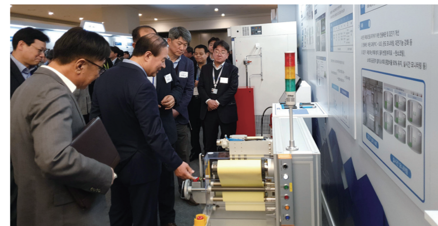
Best practice exhibition on EHS Innovation Day

We identify potential risks as a way to preemptively discover and improve on risks that may occur at workplaces and facilities, and reward best practices. This activity is undertaken at overseas worksites as well as domestic worksites, and potential risks identified as such are uploaded on our computer system to be shared across the board. In 2020, we plan to take a step further to introduce an AI-powered big data analytics program to link potential risks discovered on the shop floor with our production and facility management systems.