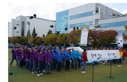
Fall Companion event engaging employees

At Samsung SDI, the grievance channel dubbed 'Sisicolcol' is under operation to file varying grievances. Once submitted, grievances are reviewed in line with our internal operational standards and proper actions are taken accordingly. In 2019, 1,083 grievances were submitted and 100% of them were all handled. Protecting anonymity when deemed necessary and proactively gathering employee feedback to make improvements will surely help Samsung SDI to create a sound corporate culture.